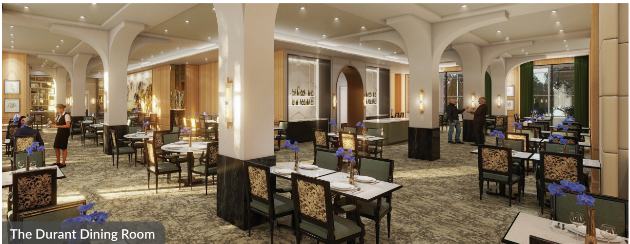
The Durant Dining Room